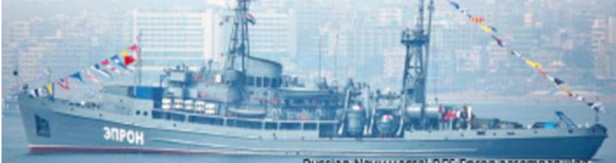
Russian Navy vessel RFS Epron accompanying the Arihant on deep sea dives and launch tests

CAN LAUNCH NUCLEAR weapons from underwater completing the nuclear triad – the ability to launch a nuclear strike from land, air or sea