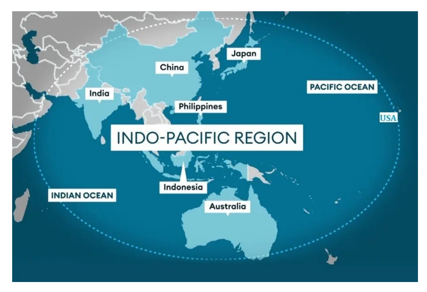
What is Japan's New Plan for a Free and Open Indo-Pacific (FOIP)?