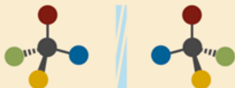
Mirror image molecules (enantiomers)

Awarded jointly to Benjamin List and David W.C. MacMillan for their development of a new type of catalysis, asymmetric organocatalysis, a precise new tool for molecular construction.