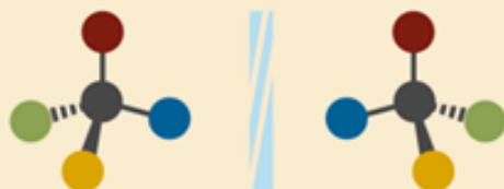
Mirror image molecules (enantiomers)

Awarded jointly to Benjamin List and David W.C. MacMillan for their development of a new type of catalysis, asymmetric organocatalysis, a precise new tool for molecular construction.