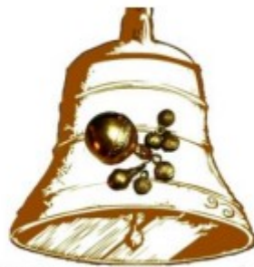
JALESAR DHATU SHILP (METAL CRAFT)