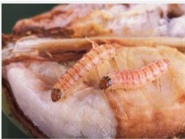
Pink bollworms emerging from a damaged cotton boll